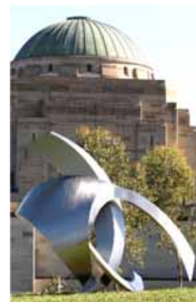
Photo: Rabaul & Montevideo Maru Memorial, Australian War Memorial, Canberra, ACT.

The Online Education package, previously Project 150, is available at: http://www.memorial.org.au/Education/index.htm