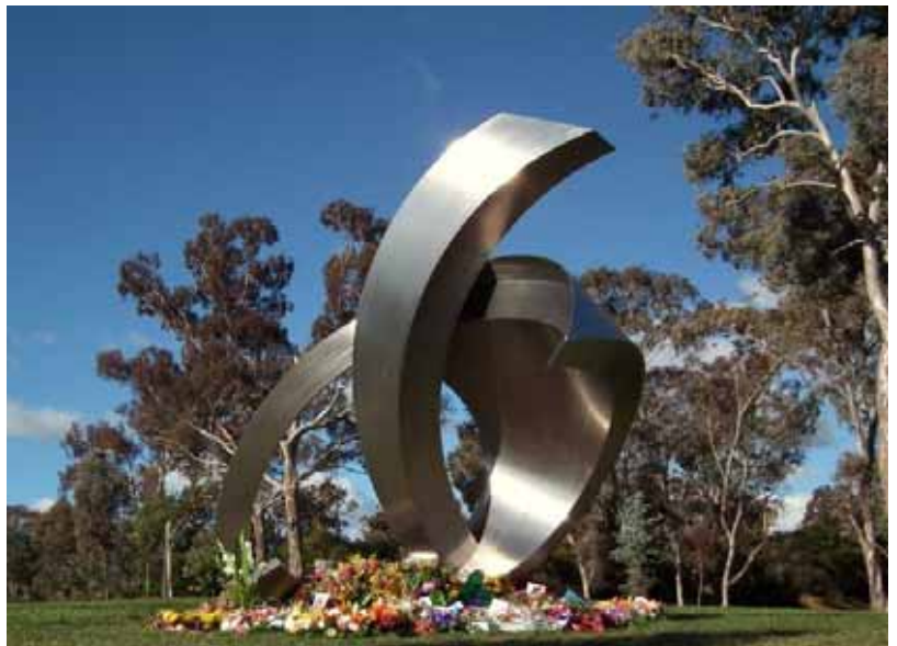
Rabaul and Montevideo Maru Memorial, Australian War Memorial, Canberra ACT Australia